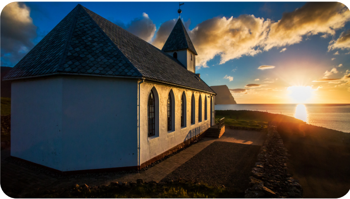
Village of Viðareiði