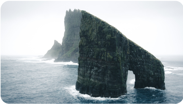
Drangarnir sea stacks