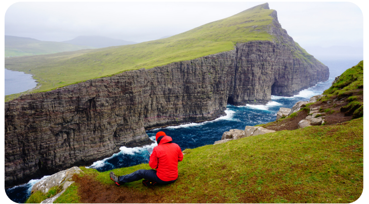
Lake Sörvágsvatn and Trælanípa