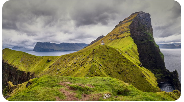
Kalsoy island: Kallur lighthouse