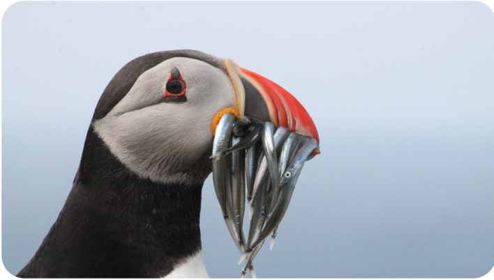
Mykines island: Lighthouse and puffins