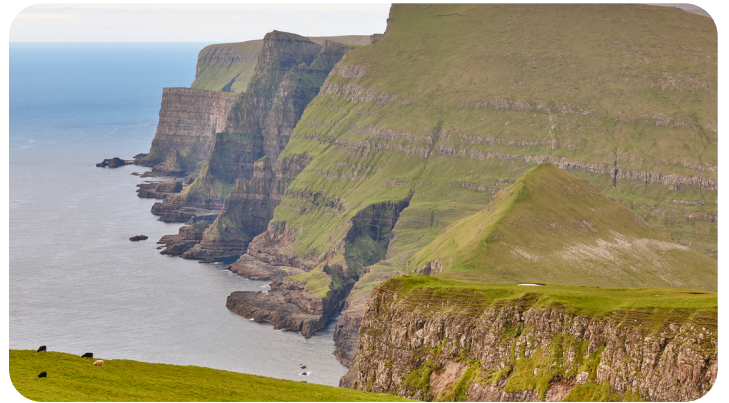
Eggjarnar and Beinisvörð cliffs